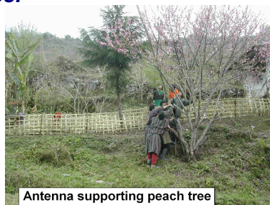
Antenna supporting peach tree