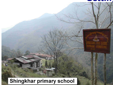
Shingkar primary school