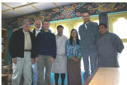
The A52CDX team at the Bhutan Information Communication & Media Authority head office

In 2004 and 2005 Bhutan Information Communication and Media Authority (BICMA) decide to promote amateur radio activity with the project to install ham-radio stations in high-schools, initially in Thimphu, then in the various areas. This project could be done with radio operator material offered by French radio hams.