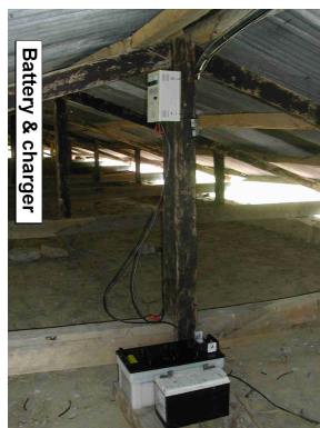
Battery & charger