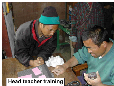
Head teacher training