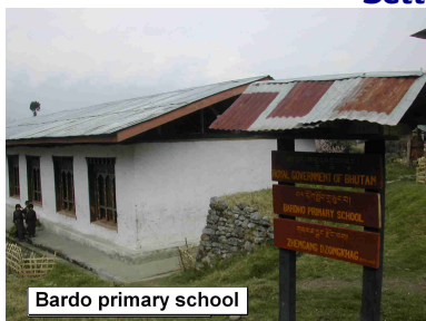
Bardo primary school