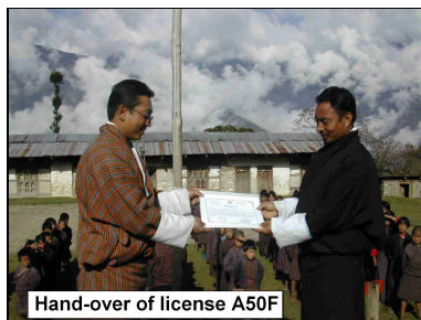
Hand-over of license A50F