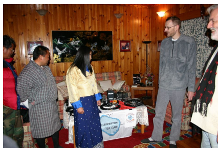
Official handover of two stations to BICMA

The first ham-radio stations were installed in the schools of Thimphu, Phuentsoling, Bardo and Shanghar. Two new stations radios were also to be installed by the BICMA in the East of the Country.