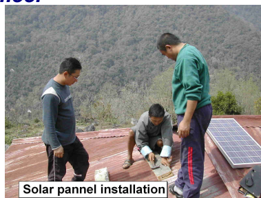
Solar pannel installation