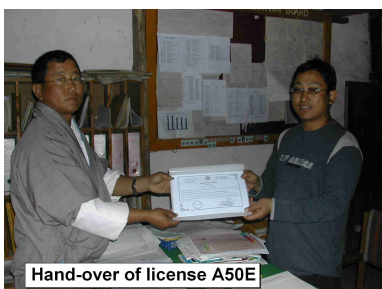
Hand-over of license A50E